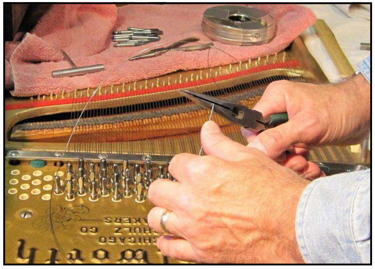
Work in progress on a restringing / repinning job.